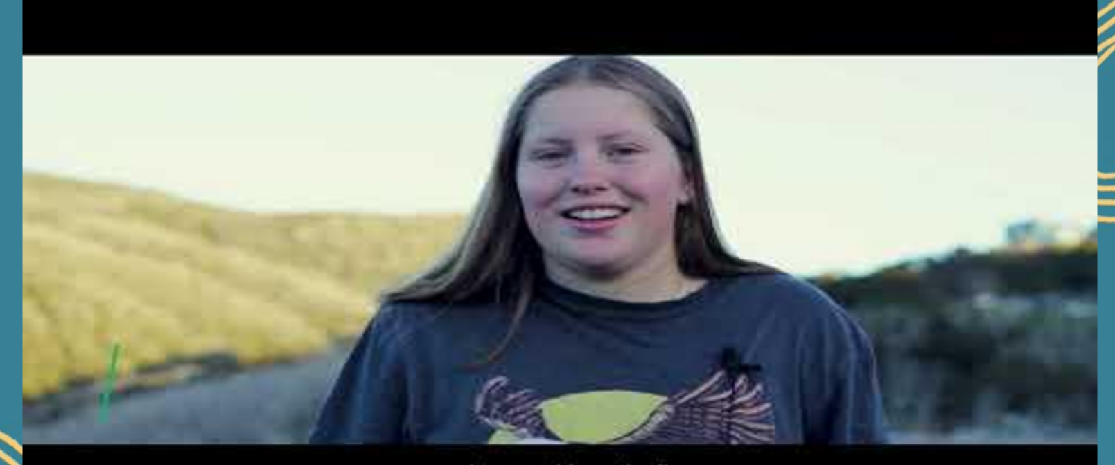
and you could see the fire